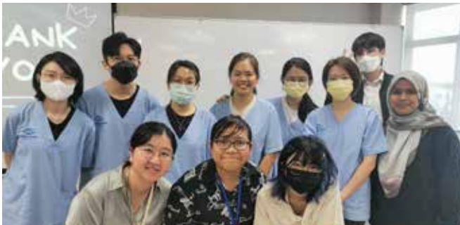
Group photo of committee members and lecturers with the Neuro Vision Team.

Through this educational talk, a total of 56 participants got the opportunity to delve into a new field of therapy, vision therapy. Interactive activities throughout the talk highlighted essential visual skills such as eye movement, eye teaming, and eye-hand coordination. On the whole, participants gained insight into the challenges faced by children with vision problems and learned about specialised therapeutic eye exercises offered by the centre. Additionally, the speakers also touched on the various career options available within this field and the required