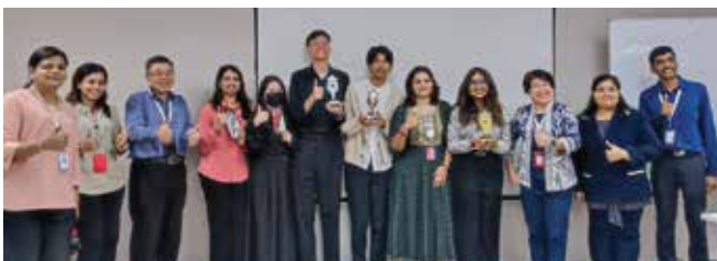
Group photo with the CN ePortfolio stars.

UCSI College hosted their very first CN ePortfolio Showcase on 21 st March 2024. The event was organized with the aim of encouraging students to develop their ePortfolios while studying at the college. This event served as a platform for students to showcase their digital portfolios and highlight their academic and extracurricular achievements. During the showcase, the top five students were selected to present their ePortfolios. Each presentation was evaluated based on the completeness of the ePortfolio, the quality of its content, and the level of creativity