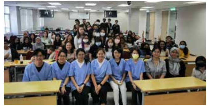
Neurovision Career Talk Event.

On the 19 th of February 2024, The UCSI Psychology Association (UPA) hosted "Vision and Learning," an educational talk in collaboration with Neuro Vision Specialist | Sun Time Vision Specialist. This event emphasises the importance of vision in the learning process. With nearly 80% of learning accomplished through the eyes in the first 12 years of life, and approximately 60% of children with learning difficulties having undiagnosed vision problems, the event shed light on the critical role of vision in education. Aligned with SDG 4 (Quality Education), SDG 10 (Reduced Inequalities), and SDG 17 (Partnerships for the Goals), the event promoted inclusive education and collaborative efforts.