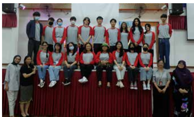
Committee and volunteer group photo.

This community outreach event aimed to raise awareness about mental health among Form 3 secondary school students. Topics about stress and mental disorders, such as General Anxiety Disorder, Schizophrenia, Bipolar Disorder, and Major Depressive Disorder were covered, along with engaging activities like Chicken Dance, Myth or Fact, and Stress Bucket. Our goal was to dispel misconceptions and foster understanding about common psychological disorders. We are grateful for the opportunity to contribute to the well-being of about 140 students at SMK Seri Mutiara.