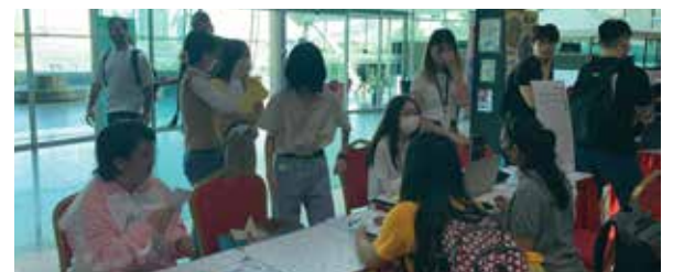
PSV booth at the Meet the Counsellor Event.

Our PSV booth hosted two engaging activities for the students to participate in. The first activity was Positive Affirmation Bingo in which the students had to achieve three "bingos" to clear the game. The bingo sheet included prompts such as "highlight an aspect of yourself that you like" and "sing your favourite song". The second activity was Positive Traits Word Search. The students were instructed to locate one trait in the word search and describe how that trait applied to them. Both activities encouraged the students to engage with our team members at the booth, and it also allowed our team to communicate with those who were present. Overall, the event went smoothly, providing valuable experiences and connections.