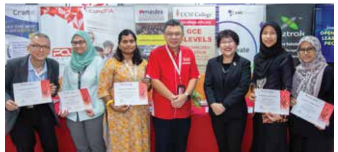
Lecturers who have completed their recording for ODL modules.

"With the world rapidly evolving and the demand for skilled professionals on the rise, UCSI College recognises the need to adapt and innovate to meet the changing needs of students," she said in her speech.