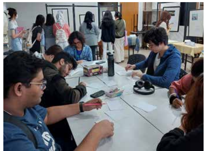
Students passing the positivity baton with heartfelt notes.