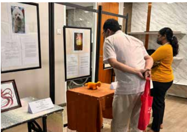
Participant reading stories of students and lecturers at the exhibition.

Three SDG goals were implemented throughout this event: SDG 3 (Good Health and Well-Being), SDG 4 (Quality Education), and SDG 17 (Partnerships for the Goals). Many attendees found the exhibition deeply moving and memorable. Through the personal stories shared and the activity of writing an affirmative message to the next individual who visits, this event has allowed attendees to connect with their emotions, practise gratitude, and understand that they are not alone. We extend our sincere thanks to MIASA and the UCSI Psychology Centre for their contribution to this impactful event.