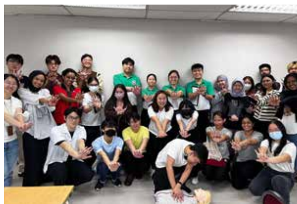
Students and lecturers taking a group photo with the St. John's team.

The training session empowered students with the confidence and abilities needed to administer first aid if needed. The event was well-received, fostering a positive learning environment and strengthening community ties. Special thanks to St. John Ambulance of Malaysia for their invaluable contribution to this event's success.