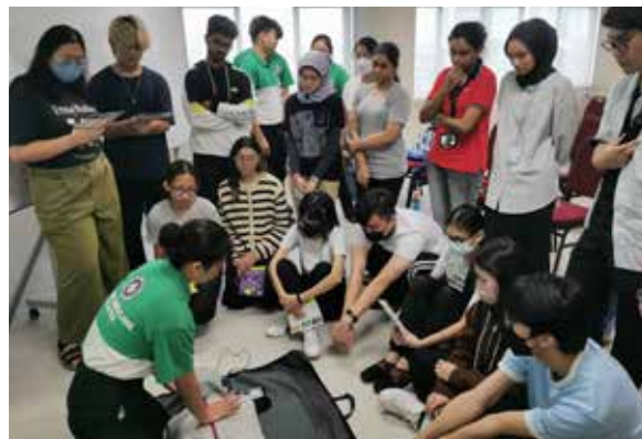
St. John member demonstrating the CPR technique to the participants.

The event commenced with an informative presentation by the SJAM members, covering their history, certification, and important first aid knowledge. Following the presentation, students engaged in hands-on CPR and AED training session, gaining practical skills and experience in life-saving procedures. The participants included students, lecturers, and administrative staff. During the training session, participants paired up and took turns switching between administering CPR and operating the AED device on CPR Manikins provided by the SJAM team.