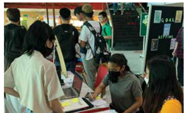
Participant engaging in a bingo activity.

On 30 th January 2024, the Peer Support Volunteers (PSV), a sub-division under the UCSI Psychology Association (UPA) that primarily focuses on promoting mental health and well-being set up a booth in conjunction with Meet-The-Counsellor Day. The event allowed students to engage in multiple activities that highlighted their personal attributes and goals, as well as to meet with the counsellors present on that day. Our booth was themed around self-esteem and our activities centred around helping students to build their self-confidence. The activities supported Sustainable Development Goals (SDG) 3 and 4, focusing on good health/well-being and quality education.