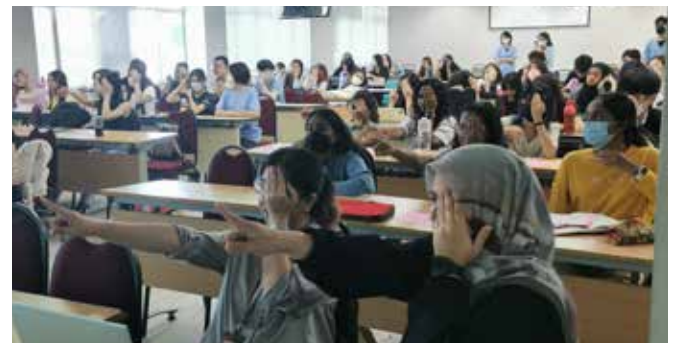
Participants engaging in an eye dominance test.

Overall, the event went smoothly and the knowledge gained is sure to be beneficial for all participants. A heartfelt thank you to the Neuro Vision Specialist team for making this event possible!