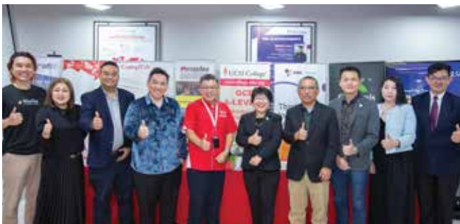
MoA signing ceremony with the partners.

Signing an MoA with its new partners - HiveTec, Craft, Masdea, AsiaHRM, AMC Group and Biztrak, the ODL programmes offered to its diploma students encompass a wide range of disciplines, including information technology, computing, healthcare, business, human resources, finance and gaming.